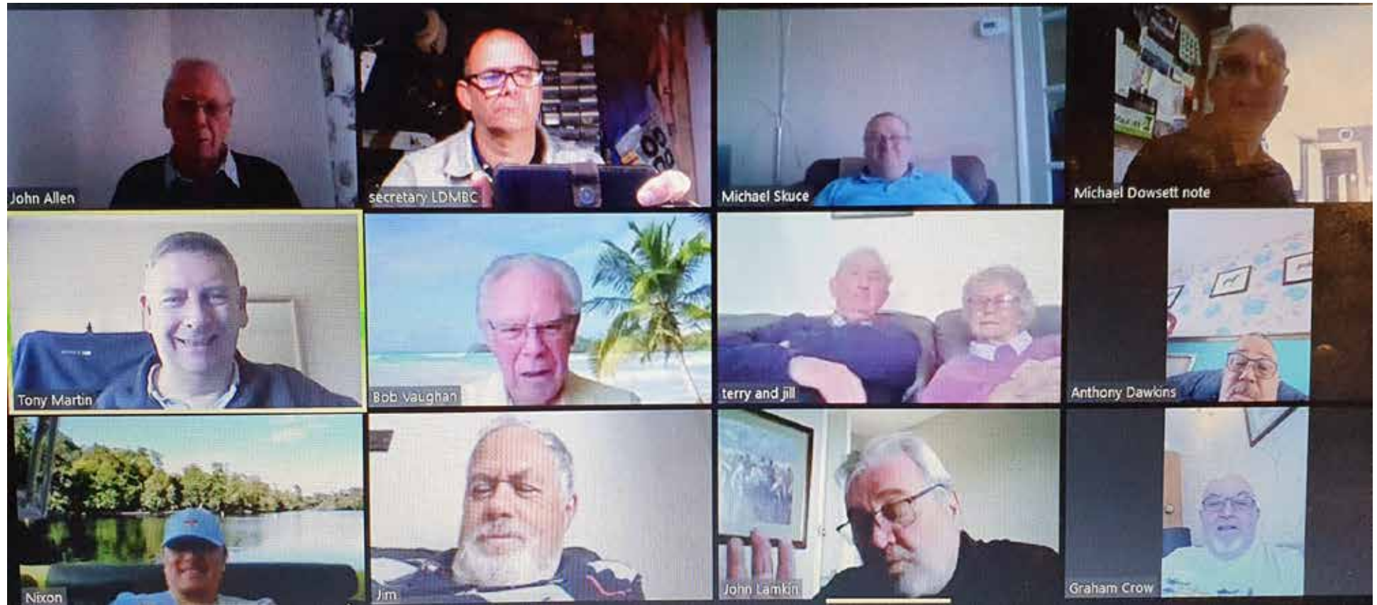
Sunday meeting 29 th March