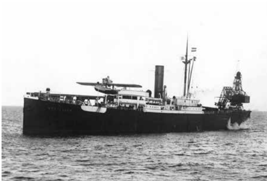
Dampfer "Westfalen" Erster schwimmender Flugstützpunkt der Deutschen Lufthansa im Transocean-Dienst ab 1934.