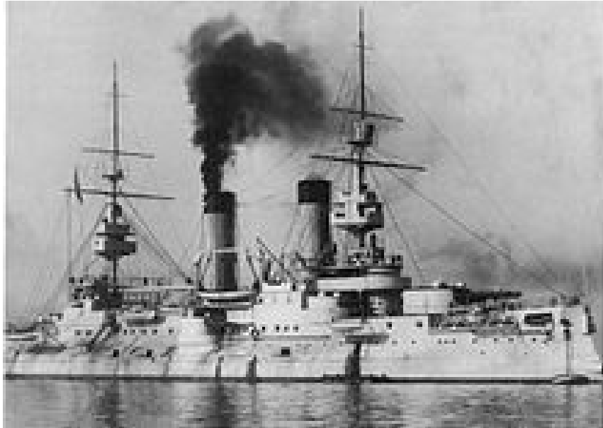
Tsesarevich during her sea trials in Toulon, France, 1903

Construction began on Tsesarevich, named after the title of the heir to the Russian throne, on 18 May 1899 at the Forges et Chantiers de la Méditerranée shipyard in La Seyne-sur-Mer, France. The ship was laid down on 8 July 1899 and launched on 23 February 1901. Construction was supervised by Captain Ivan Grigorovich, who became the ship's first captain. Tsesarevich entered service in August 1903 and was assigned to the Far East. She arrived in Port Arthur on 2 December 1903. Upon completion, the Tsesarevich was the Russian Navy's best battleship at the beginning of the Russo-Japanese War.