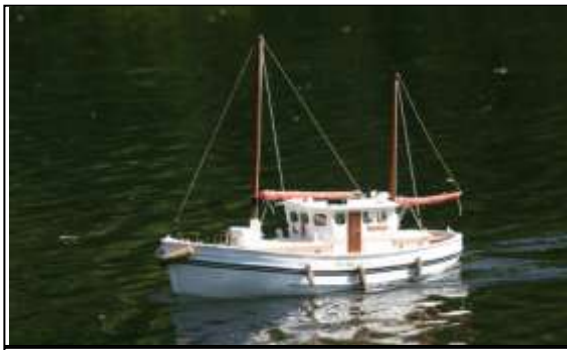
Wardown Park 7/7/2013