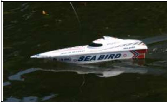
Wardown Park 7/7/2013