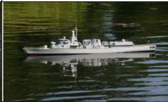
Wardown Park 7/7/2013