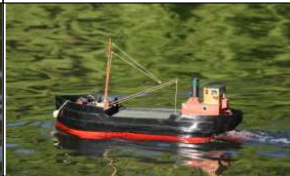
Wardown Park Night Sail 11/7/2013