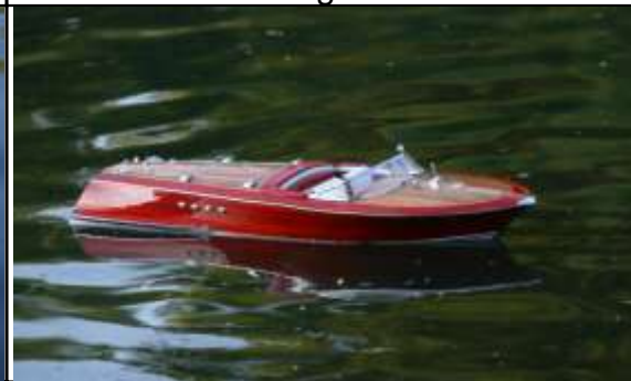
Wardown Park Night Sail 11/7/2013