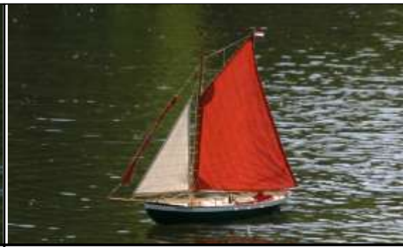
Wardown Park 7/7/2013