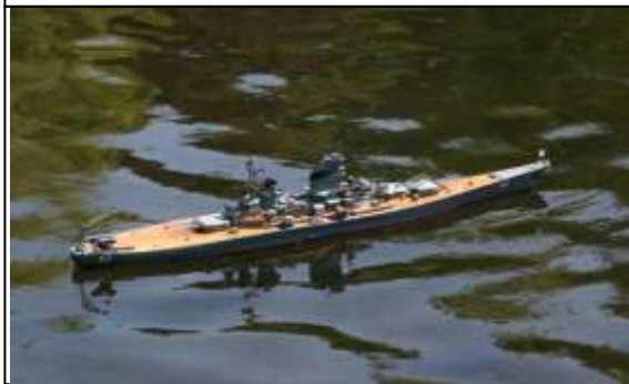
Wardown Park 7/7/2013