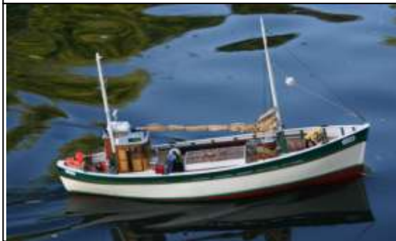
Wardown Park Night Sail 11/7/2013